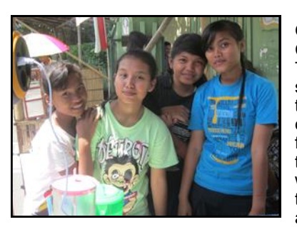
Before Selling - Photo Op ...