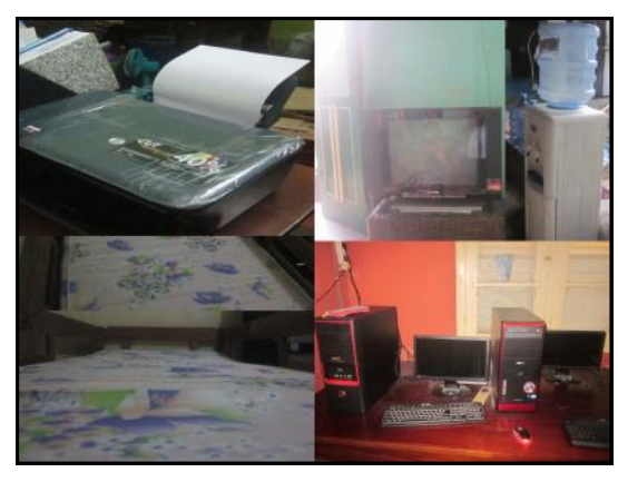
All the gifts were so very much appreciated