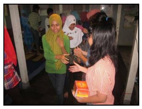
Receiving visits from local student groups.