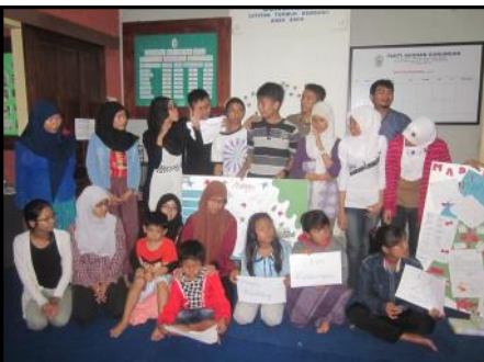
Learning to make noticeboards together with university students from the university magazine forum.