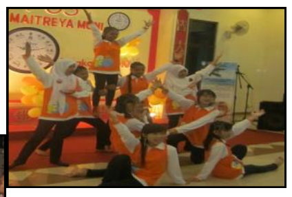
Activities with INLA still continue to run, and the children are getting better and better at performing on stage.