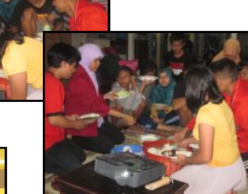
University students who had visited previously for work experience, returned to hold events with the children. They grilled corn, grilled fish, and watched a movie together. It's great when guests return and still remember our children. Thank you UNISRI friends.

Invited to the birthday party at Cinema XXI Solo Square, the kids watch the animated version of Red Riding Hood. It's a cute movie, but because it was in English and the Indonesian subtitles went too fast, some of the children struggled to fully follow the story.