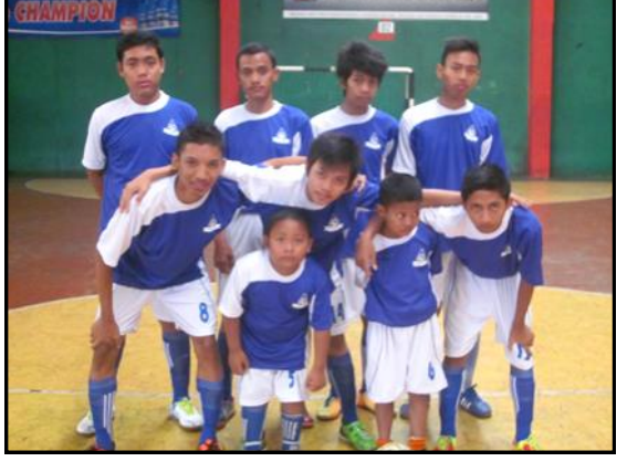
Gunungan Indoor Football Team

Using the local park is free, and after searching for information about the cost of indoor football, they found the cost for one game (duration one hour) was Rp40,000, (approx. US$ 3.5) during the day and Rp 50.000, (approx. US$ 4.5) at night. The lads chose the night time because they have school during the day. Since the decision was made to join indoor football, the boys ended up going almost every night of the week, from 6.30 till 7.30 in the evening.